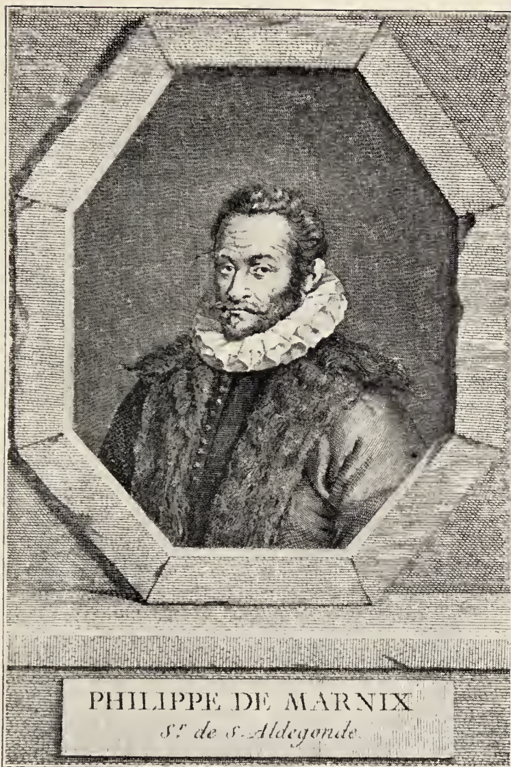
PHILIP DE MARNIX, SEIGNOR OF SAINT ALDEGONDE. After a contemporaneous print, reëngraved by Houbracken.